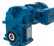
Parallel Shaft Geared Motors