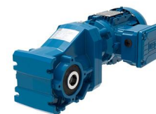
Helical Bevel Geared Motors