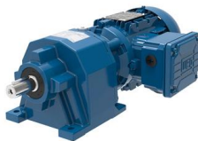
Helical Geared Motors