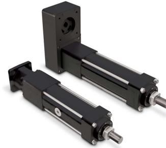
RSX Series Extreme Force Electric Actuator

Tolomatic precision ground planetary roller screws are used to achieve long life and precision. The RSX series is designed and tested for long life and reliable performance in demanding conditions including cold weather operation. The RSX series includes two frame sizes capable of achieving 18,000 lbf to 30,000 lbf (80 kN to 133 kN) max force.