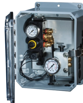
TDB Series Dump Box Control System

Flow Products is your local authorized distributor and application specialist for all your hydraulic and pneumatic product and control system needs. Call us for additional information, technical training requirements and product application reviews.