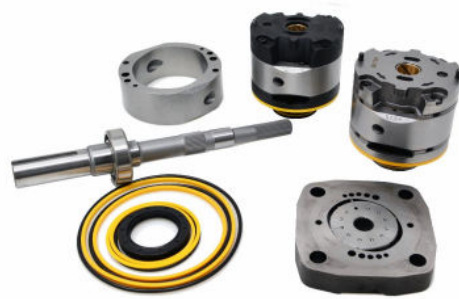
AV Series Vane Pump Replacement Parts