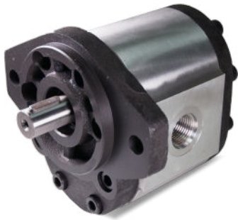
Hydraulic Gear Pumps