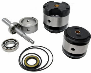
AT Series Vane Pump Replacement Parts