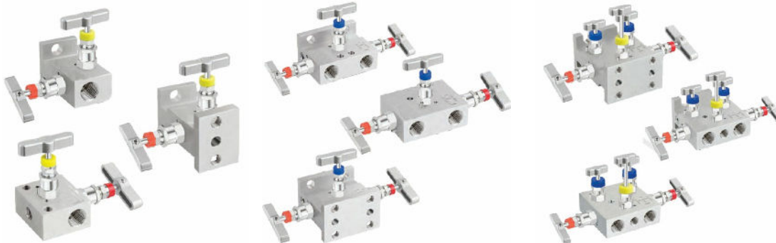
2-handle – 1 isolation valve, 1 vent valve