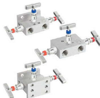
5-handle - 2 isolation valves, 1 equalizing valve and 2 vent valves.