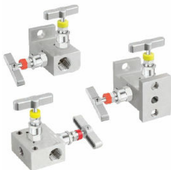
3-handle - 2 isolation valves, 1 equalizing valve